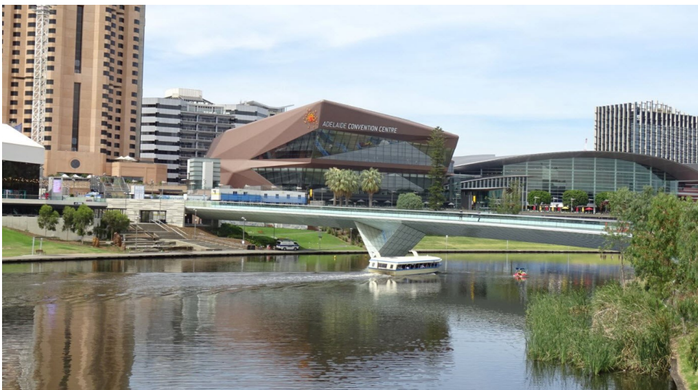
The scenic Torrens River looking into the ever growing Adelaide skyline.