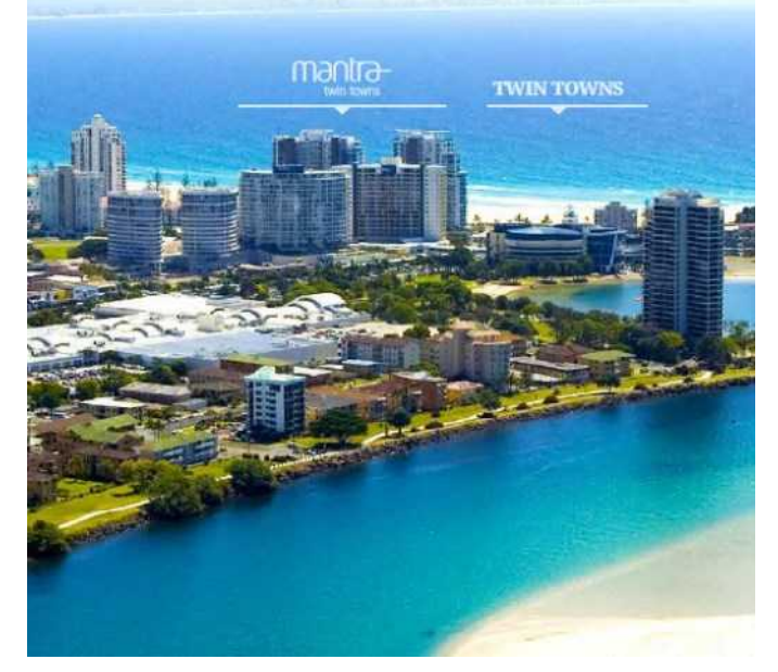
The set up of the hall and logistics of preparing the venue for the concert will allow those non playing members who feel inclined to get involved. The rehearsal day and concert is planned for the same venue. The Civic Centre is located about 4 blocks from the Tweed Heads Services club which makes it very convenient to local accommodation including the Mantra Twin Towers resort accommodation.

The plan is for the Veteran band members (those that are able) to arrive a day earlier than would otherwise normally happen. This will allow us to have a full day of uninterrupted rehearsal. This will free up Friday & Saturday to allow all members to be involved in a full range of planned activities. The Gala concert is planned to take place at the Tweed Heads Civic Centre Auditorium on the Sunday commencing at 2pm. This will allow for a final top and tail rehearsal and sound check prior to the concert.