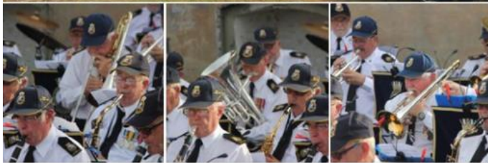
RAN Veterans Band, performing in PNG.

‘On a number of occasions now, people that were dying of cancer, that knew it was their last effort to do something, have come along for the last hurrah,’ he said. ‘In Singapore, we had one chap who knew he was dying. He came over and did all the concerts with us and the Anzac service and came home. Then a few months later, he passed. We’ve had that happen a number of times.’