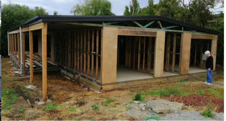
LEFT: Frame up on the and ready for the roof and Pergola to be completed. RIGHT: Roof and Pergola finished ready for windows in the new year. In by Easter 2023

In 2019 the shop launched our mobile sound stage that we built and held two Christmas carols before putting it in storage over the 2019/2020 Christmas break. We were looking forward to a very successful campaign with the stage for festivals and community events except we didn't predict Covid.