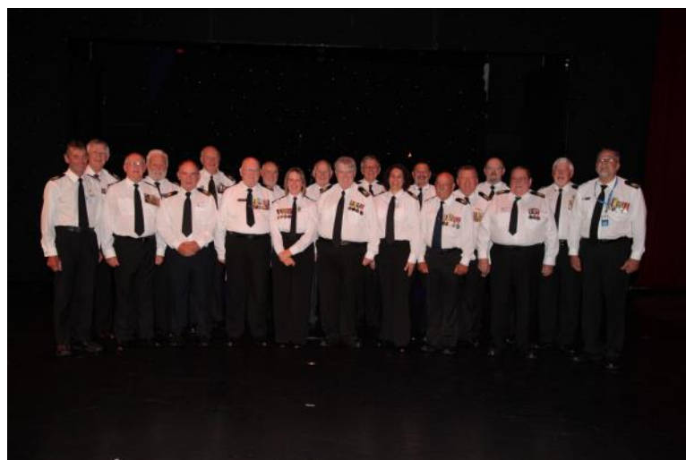
Veterans Band.