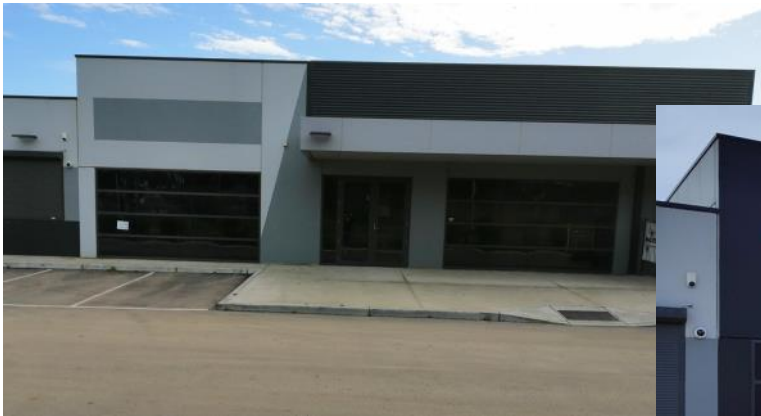
Above is the shell we took on and it's very bland appearance. Right, after a paint job and some great signage its come up well. The open out Café will be to the right of the door, Yes we are having a café in the music store.

With new tenants taking our current shop we had only 4 weeks to build, move out, make good the old premises and still attempt to trade. In those weeks of September we went from an empty shell to a fully operating retail store, with October opening to our first customers. The photos show the transition of what we had done.