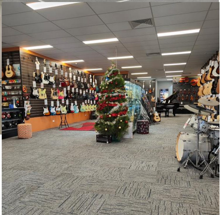
Right: the finished shop with walls and 50 metres of slatwall installed, 5 teaching studios and recording studio down the back. Should do us for the next 10 years. I won't be there to do it though.