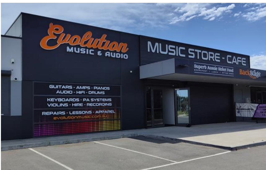
The photo on the left was in the Christmas mag and below with the café now opened to the public.