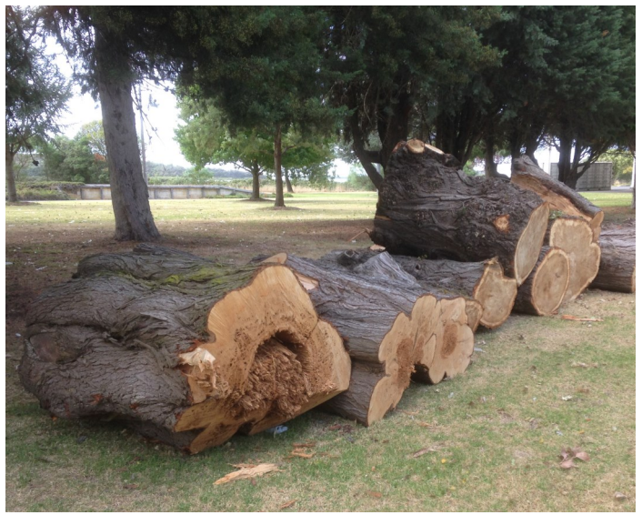
Some of the massive stumps ready for removal from grounds. The Railway platform in the background.

With so much happening at the Museum in HMAS Cerberus it is important that we keep members up to date. On returning from the festive break the volunteers found plenty of things going on in and around the museum and look forward to a productive 2018.