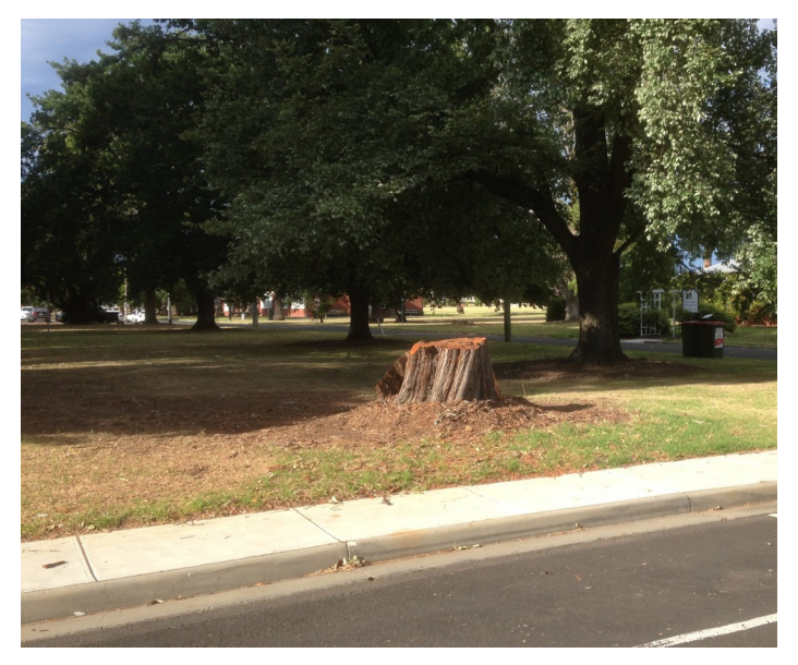
Looking out from the entrance of the School of Music across to the admin building.